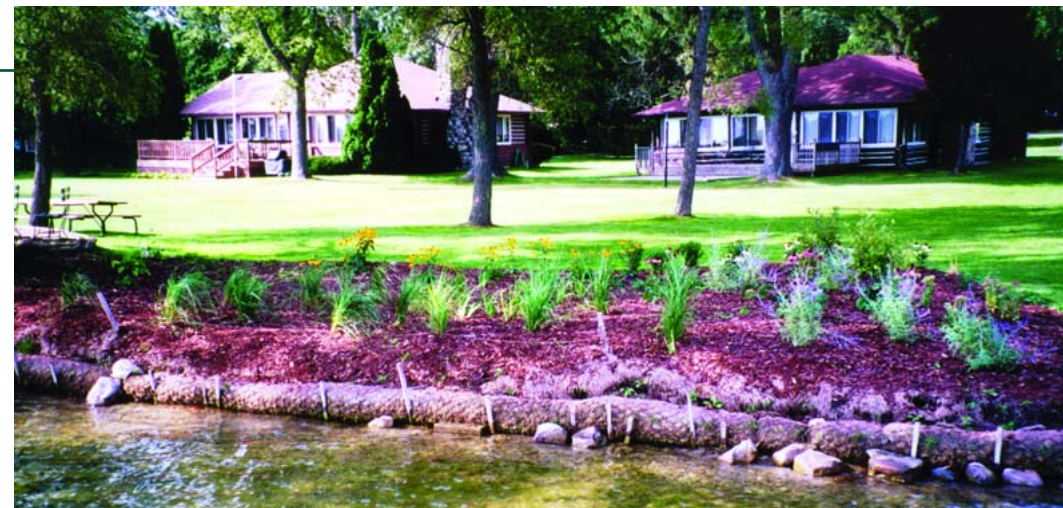
A well-planned landscape with natural vegetation and fiber logs along the shore can reduce soil erosion, preserve the views and allow access to the water.

Much can be done to enhance the natural characteristics of areas that are currently maintained as mowed lawns. However, areas of full sun