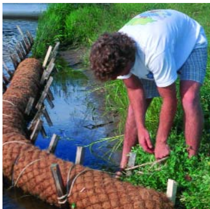
Fiber logs are one option for stabilizing the shore.

Native plants can help stabilize shorelines and reduce erosion. In the water, aquatic plants, such as